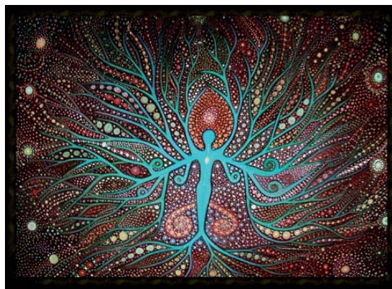
Original art by Farshad Sanaee entitled 'The Guardian'

The time during the gathering for contemplative spaces were critical, after the many input sessions.